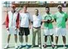
١٠ لاعبي العراق يرحبون بالفوز على عمان في المباراة الأولى.