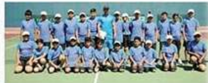
١٠ لاعبي عمان يرحبون بالفوز على العراق في المباراة الأولى.